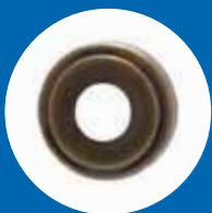
US5 Antique Brass