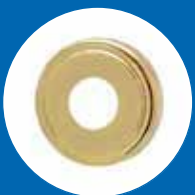
US3 Polished Brass