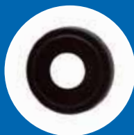
US10B Oil Rubbed Bronze