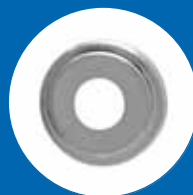
US15 Satin Nickel