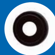
US19 Dark Black