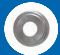
US26D Dull Chrome